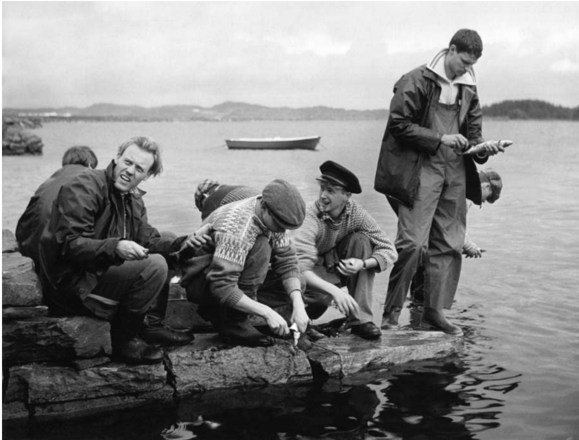
■ Fishermen at 1942 - someone to trust?