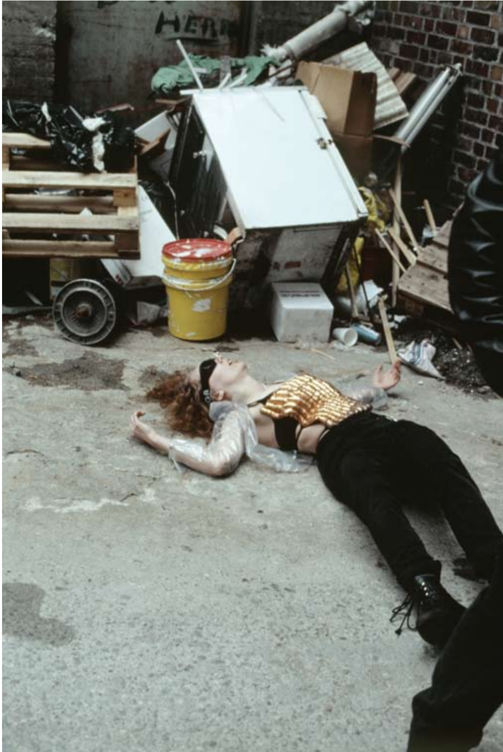
■ A scene from the futuristic larp Ultrapolis