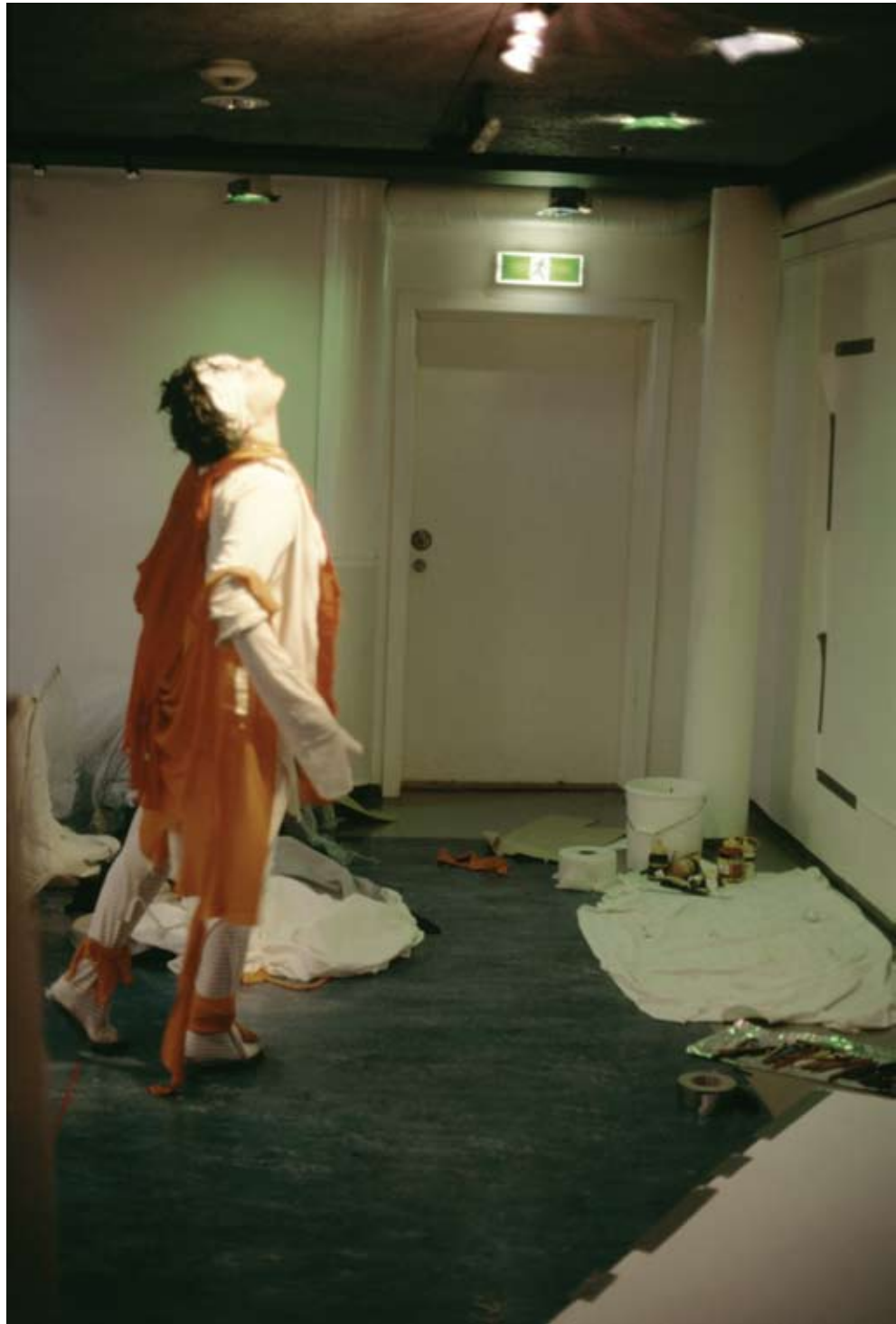
■ A scene from the futuristic larp Ultrapolis