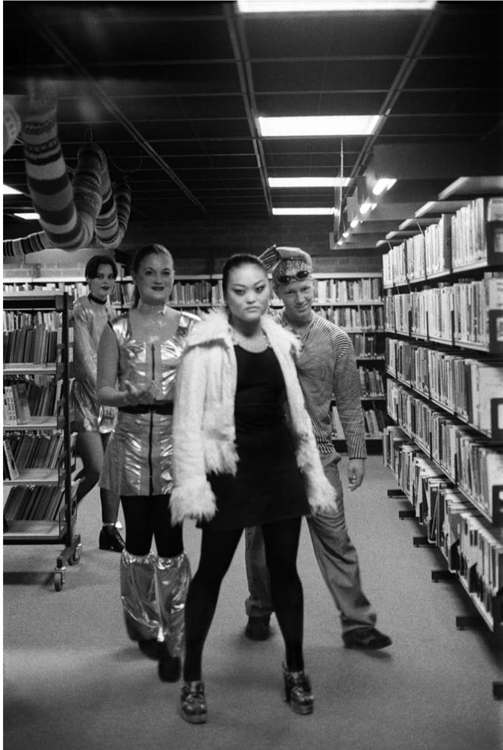
■ Players at a cyberpunk genre larp, held in the library of a Norwegian boarding school.